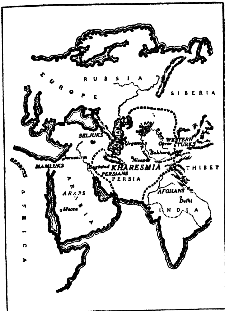
THE KHARESMIAN EMPIRE AT THE BEGINNING OF THE THIRTEENTH CENTURY, SHOWING THE POSITION OF THE OTHER MOHAMMEDAN POWERS.