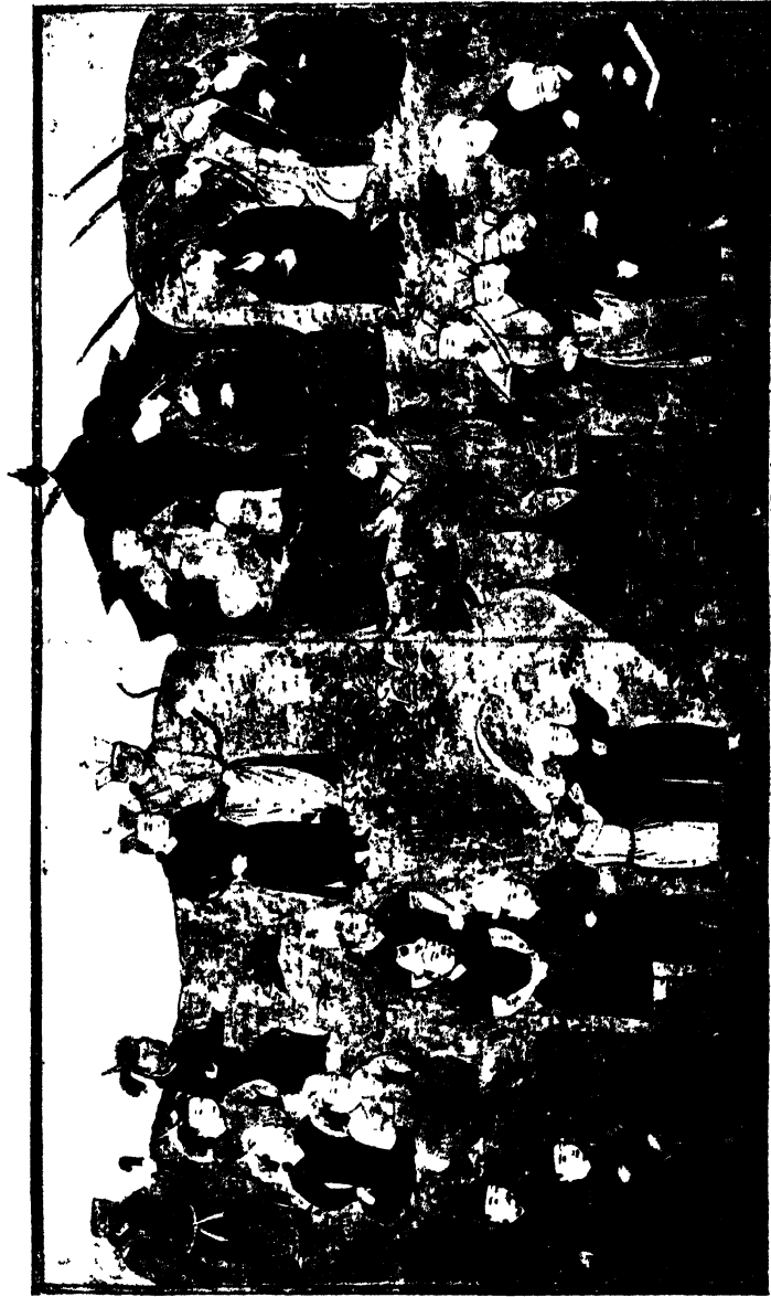
GHAZAN, THE B-KHAN OF PERSIA, SURVIVOR GENERATIONS AFTER GENGHIS KHAN.