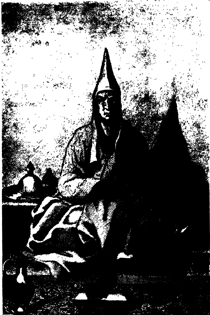
SHAMAN TIBTENGRI, THE MONGOL WIZARD. From an old French Work on Lintary.