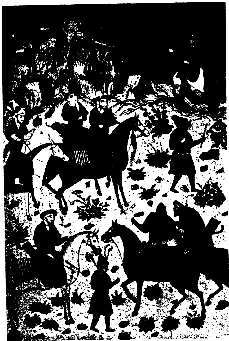
A PERSIAN HUNTING SCENE, EARLY SIXTEENTH CENTURY. This shows the types of weapons used for the chase.