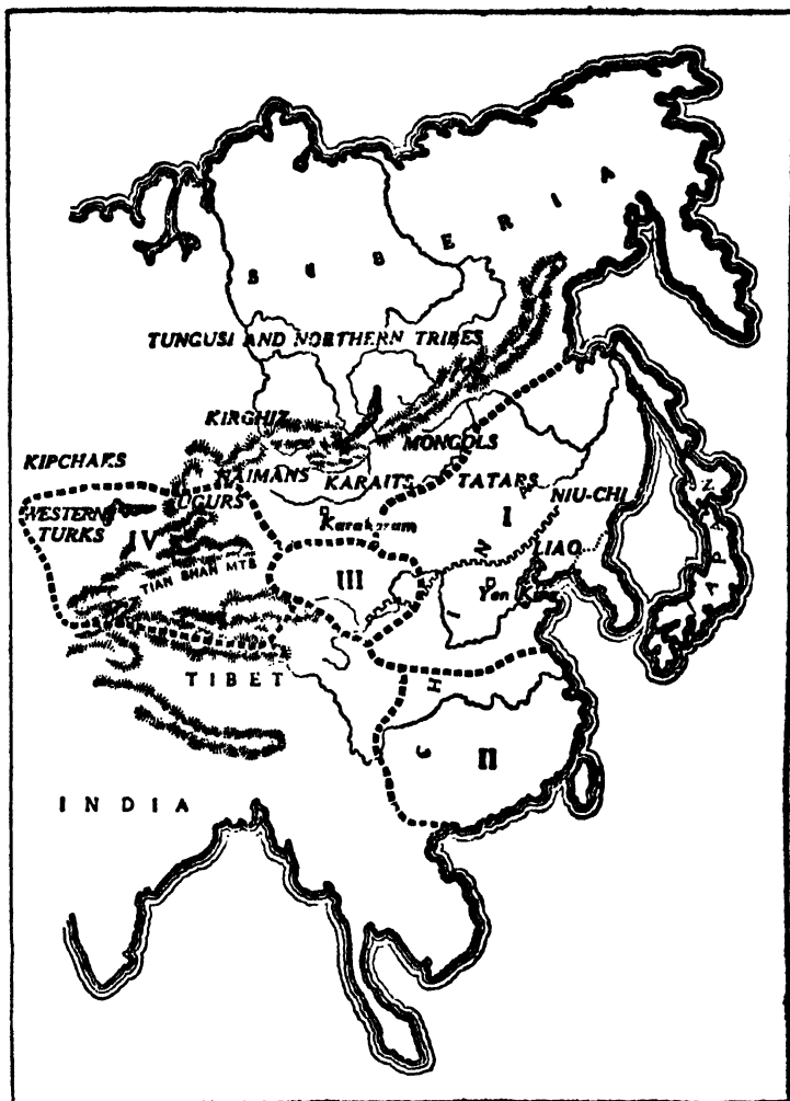
EASTERN ASIA, AT THE END OF THE TWELFTH CENTURY.

I. The Chin Empire; II. The Empire of the Lung; III. The Kingdom of Hia; IV. The Empire of Black Cathay.