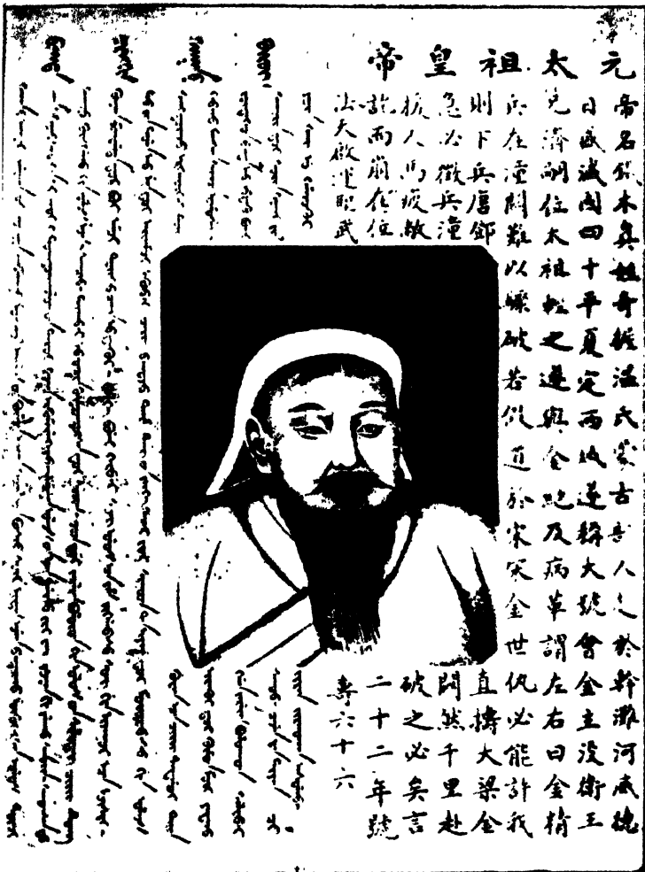
From the Journal of the North China Branch of the Royal Asiatic Society. Vol. 111