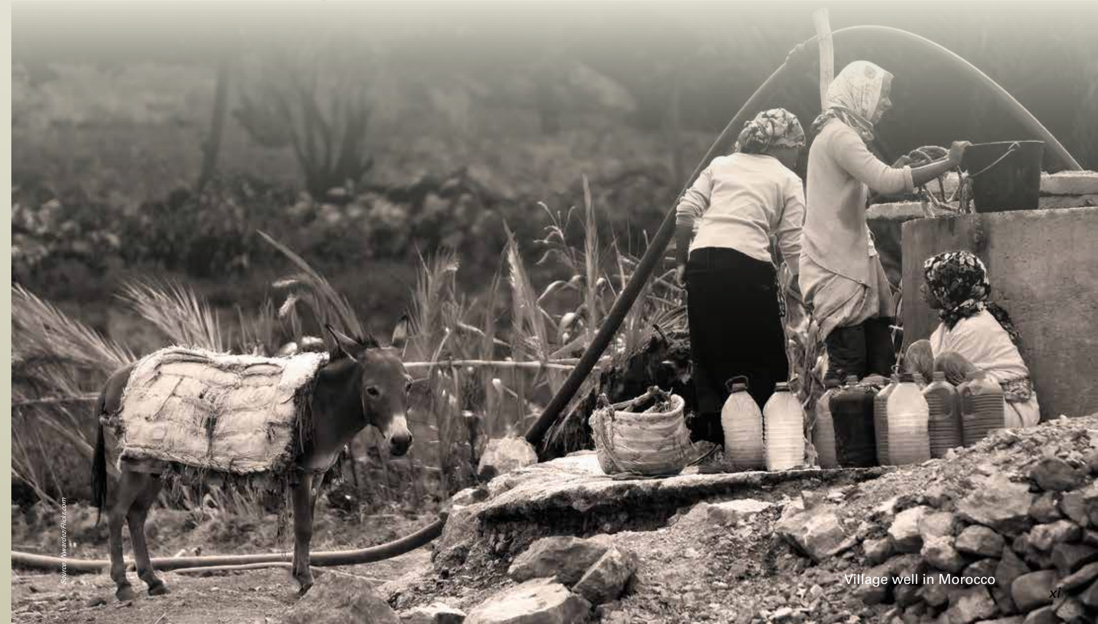
Village well in Morocco

The Arab region further represents an economically diverse region that includes the oil-rich economies of the GCC countries and the more resource-scarce countries (in relation to population) such as Yemen, Egypt and Morocco. Oil wealth has catapulted the standard of living in many of these countries and spurred increased resource consumption, exerting greater pressures on natural resources. Though the hydrocarbon sector continues to serve as the backbone of many of the countries' economies (especially the GCC countries and some of the North African countries), these nations are attracting foreign and domestic investments outside the energy sector and investing heavily in developing other sectors—the tourism industry is now the fastest growing sector in the region.