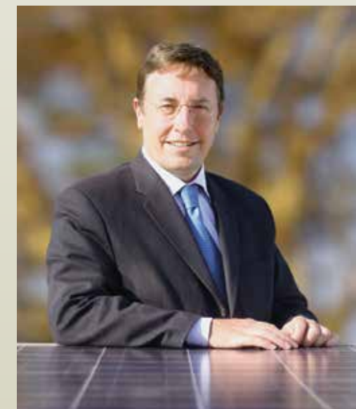
Achim Steiner UN Under-Secretary General and UNEP Executive Director

UNEP would like to thank the Ministry of Environment and Water, United Arab Emirates; the Abu Dhabi Global Environmental Data Initiative (AGEDI) and the many experts and reviewers from the Arab Region for their invaluable support, expertise and collaboration on this publication.