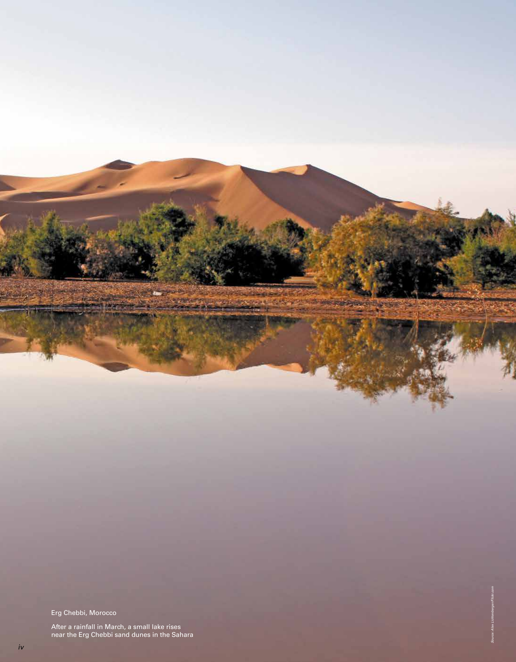
Erg Chebbi, Morocco

After a rainfall in March, a small lake rises near the Erg Chebbi sand dunes in the Sahara